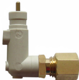
AEV 3W / AEV 3Wi