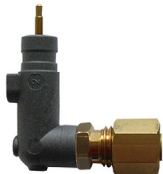
EV 3W / EV 3Wi